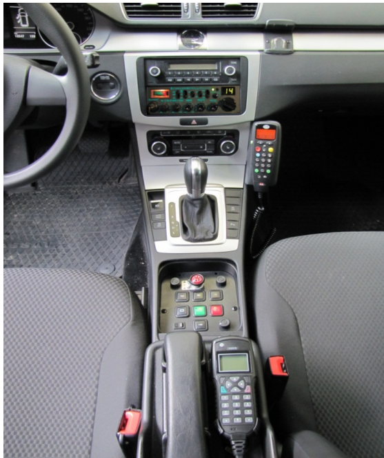
Figure 1: ~20 functions in a police car

were added on demand as isolated applications. Current police cars already have roughly 20 electrical based special functions.