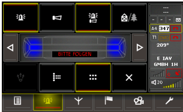
Figure 4: The roof bar level of the SFA

With these rules Volkswagen and its partners designed the system.