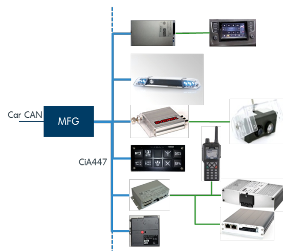
Figure 2: Exemplary architecture with CiA 447

The first approach was to attach those special car components which communicate to the CiA 447. A dedicated sub-domain was created.